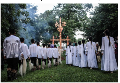
-Festival International "Echanges, Cultures et Traditions du Monde" , Romans sur Isère, included special

40è Festival « Les Cultures du Monde », Gannat - Day of ICH «24 hours for etrenity», included a day of recollections of the past 40 years of celebrating Intangible Cultural Heritage and thinking about it's future. It included a round table discussions on procedure of ICH items recognition, recollection on 40 elements inscibed on ICH list, which took part in the festival in the last 40 years, special exhibition, film presentations, presentations of traditional ritual «Night of Spirits» of Yakutia and press-conferences,