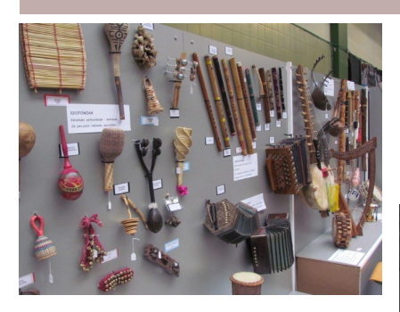
The following events and activities were dedicated to the 10<sup>th</sup> Anniversary if UNESCO ICH Convention: