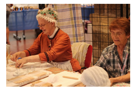
Festival des Folklores du Monde «Envie d'Ailleurs» de Bray-Dunes included, special international

Festival "La Ronde des Copains du Monde", Ambert, included a special workshop on Auvergne costumes, their history and evolution.