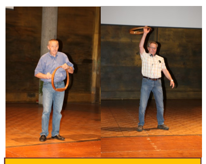
The " Reifschwingen ", a living tradition in danger. Only 4 persons still know the practice.

Six experts presented their reflections and proposed, herewith, some future for the living traditions that need protection. The detailed program is available on the website <u>www.JaimeLesTraditions.ch</u>